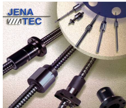
Precisions Ball Screws from miniature type to large industrial types

Precision products from prototype to commercial quantities produced in accordance with DIN ISO 9001