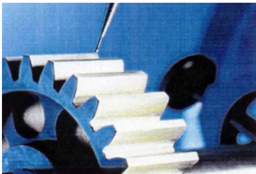
Gear profile to customers specification

Jena Tec offer specialist technical advice and engineering know how to meet your requirement